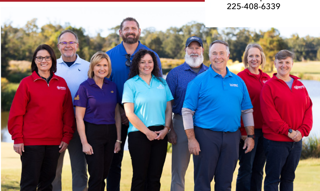
Pictured: 2025 tournament host credit union CEOs with the 2025 charity recipients from Redstick C.A.R.E.S.